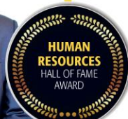
HUMAN RESOURCES HALL OF FAME AWARD