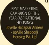
BEST MARKETING CAMPAIGN OF THE YEAR (ASPIRATIONAL HOUSING) Joyville Hadapsar Annexe - Joyville Shapoorji Housing Pvt. Ltd