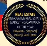
REAL ESTATE INNOVATIVE REAL ESTATE MARKETING CAMPAIGN OF THE YEAR VANAHA - Shapoorji Pallonji Real Estate

The awards were given under the categories of Branding & Marketing, Digital Marketing & Social Media, Shopping Mall & multiplex, Human Resources, Multiplex, BFSI, CSR, Education, Women Leadership, Real Estate, IT & ITES, Manufacturing, Logistics and IoT.