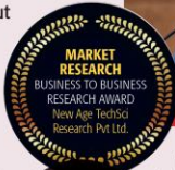
MARKET RESEARCH BUSINESS TO BUSINESS RESEARCH AWARD New Age TechSci Research Pvt Ltd