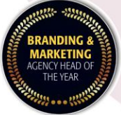
BRANDING & MARKETING AGENCY HEAD OF THE YEAR